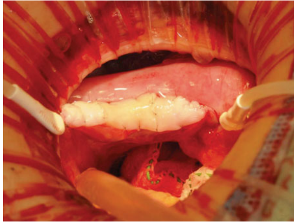
Fig. 4.2 Completed ovarian cortical graft through minilap incision

Plastic surgeons use pressure dressings over skin grafts to avoid this most common cause of graft ischemia and delayed vascularization. Since we have no such option intra-abdominally, we use multiple minuscule stitches of 9-0 or 10-0 nylon sutures, and prepare the graft bed carefully with pinpoint microbipolar hemostasis while at the same time employing constant irrigation with heparinized saline to avoid adhesion formation. Finally, it is probable that an orthotopic location allows for better ovarian function than a heterotopic one, perhaps due to more normal tissue pressure during ovarian follicle maturation [16, 17–19].